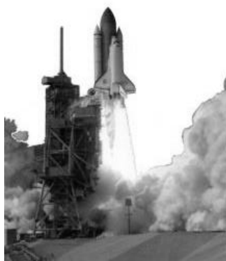
NCFI polyurethane insulates the space shuttle’s fuel tank.

Contact your NCFI applicator for assistance in designing your insulation project.