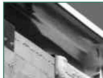
Figure 4: SPF application at the roof-wall juncture. The spray pattern can be seen at the lower right corner of this photo.

SPF nicely bridges structural steel column to masonry joints. However, building movement and settlement may crack the SPF at these joints. To avoid potential problems, a self-adhering mem-