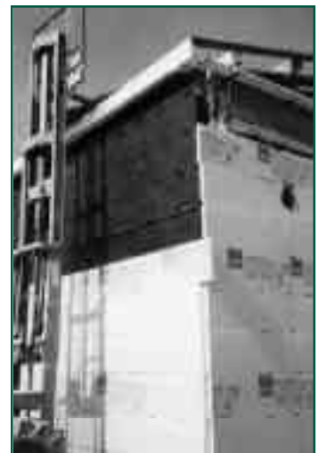
Figure 2: Conventional dampproofing and insulation.