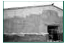
Figure 7: Effects of UV exposure. Lighter SPF was applied several days after the darker SPF.

If left exposed indefinitely, the dusting SPF surface will wash off, and eventually the thickness of the SPF will begin to diminish. Field studies suggest that the SPF may be left exposed for up to six months without deleterious effects. If the construction schedule suggests that the SPF will be left exposed for longer than six months, the foam may be thinly coated with an acrylic coating or the specified foam thickness can be increased by 1/4 inch.