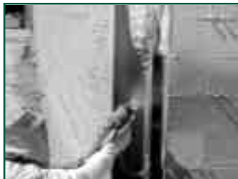
Figure 3: SPF readily fills construction voids.

For example, to achieve an R-10, a 1.5-inch thickness of SPF will provide sufficient R-value to replace 2-inch thick polystyrene board.