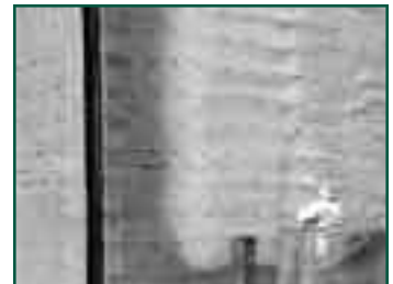
Figure 1: SPF application to CMU wythe.

SPF is closed-cell and does not readily absorb liquid water. To verify its resistance to moisture penetration, 1/2-inch thick samples (triplicate) were tested using a Suter Hydrostatic Pressure Tester in accordance with AATCC 1 Test Method 127 Water Resistance: Hydrostatic Pressure Test . In this particular test, a hydrostatic head of 55 cm (22 in) was maintained for five hours, after which the head pressure was raised at a constant rate of 1 cm/sec (0.4 in/sec) until failure or maximum hydrostatic head pressure was reached (failure is indicated by the appearance of three water droplets on the bottom surface of the specimen). All three samples tested reached the maximum hydrostatic pressure of 184.9 cm (72.8 in) without failure.